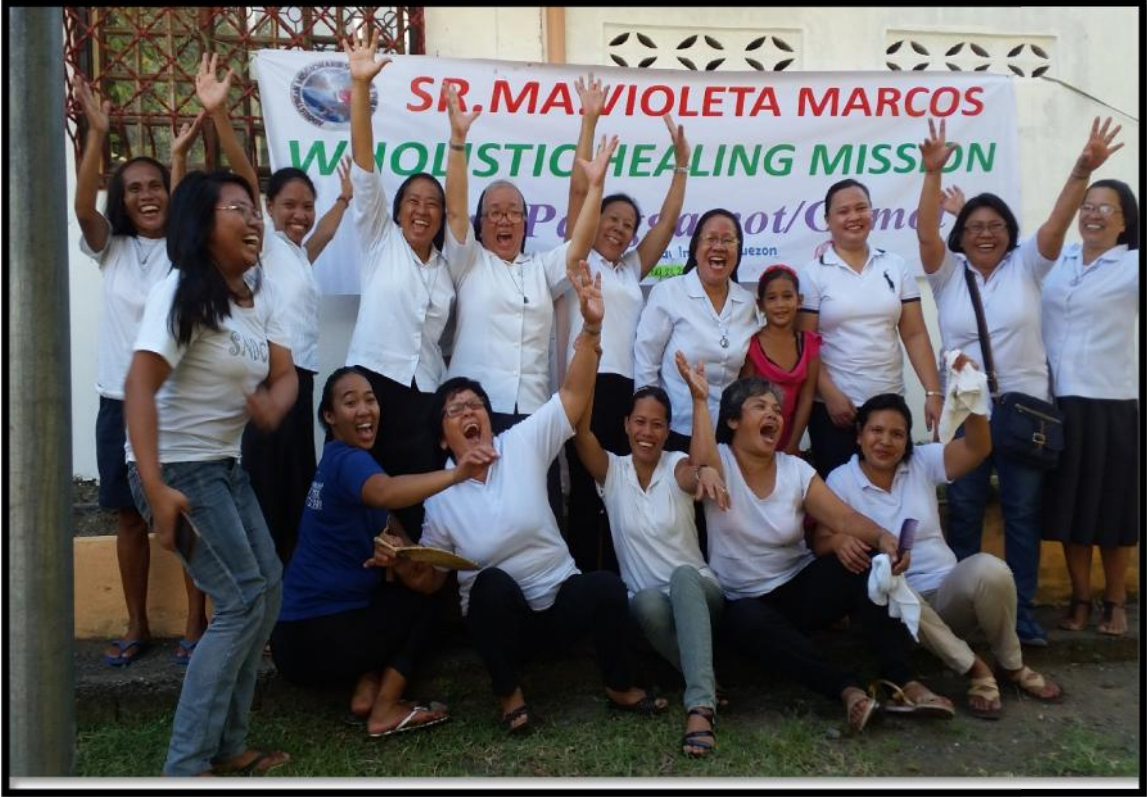
Of the Augustinian Missionaries of the Philippines and our Community Health Missionaries