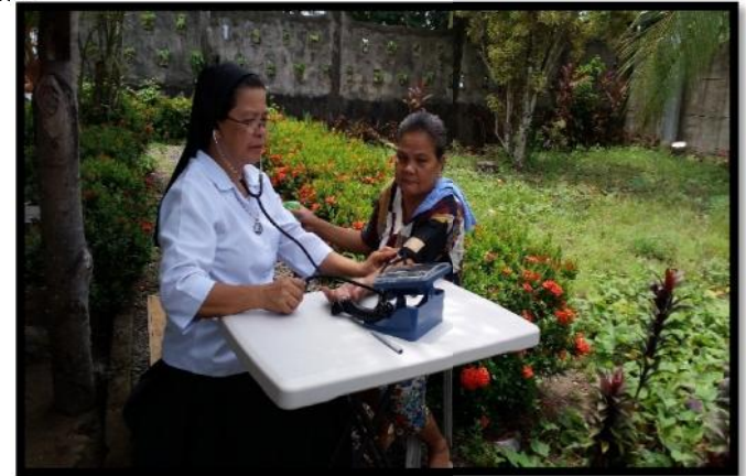
2. Taking of Vital signs