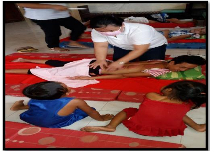
4.1. Back Massage for Children and Adult