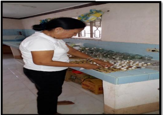
4.3. Cupping and Bentusa