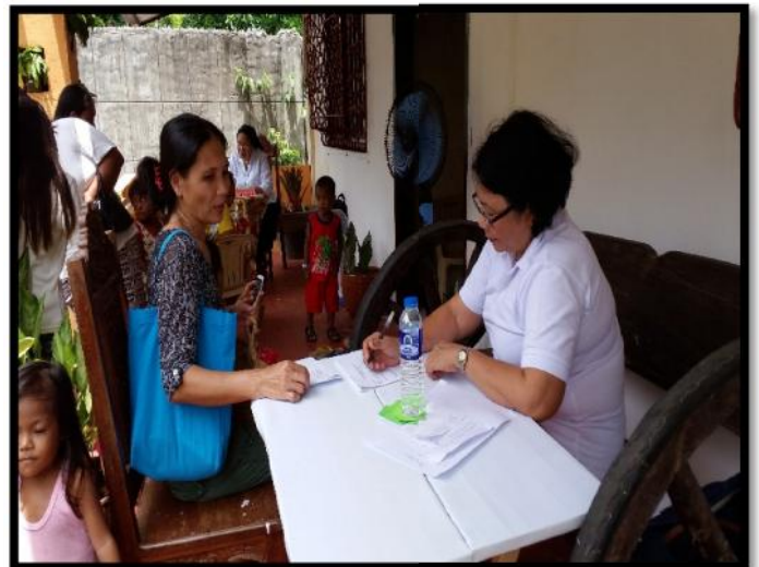
3. Consultation / Diagnoses