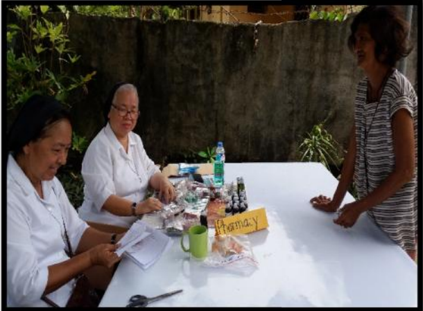
The HEALING SMILE of the HEALERS...